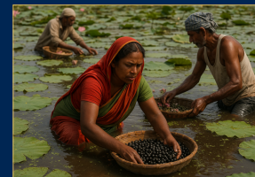
Harvesting Gathering Phool Makhana