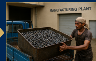
Transport Bringing Seeds to Plant