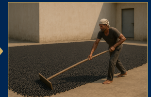
Drying For moisture reduction