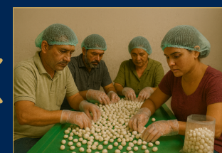
Sorting Picking & Grading