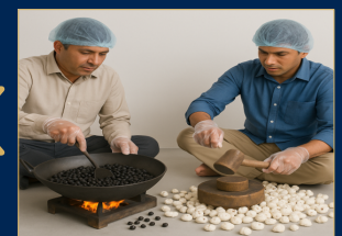
Processing Roasting & Popping