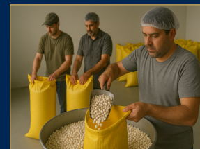
Packaging Sealed in food-grade packs